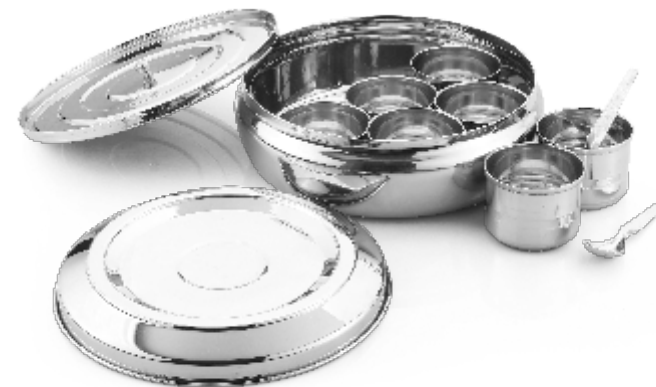
Belly Masala Dabba