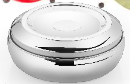
Belly Puri Dabba