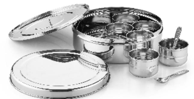
Sada masala Dabba