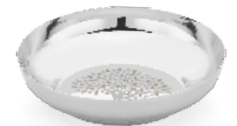
Swiss Halwa Plate