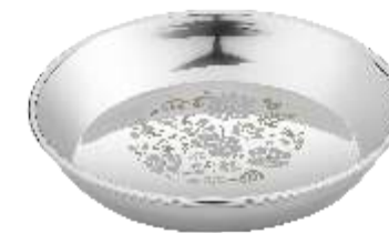
K.B Halwa Plate